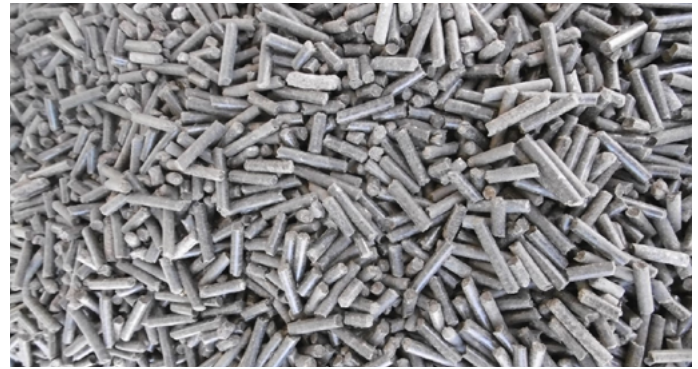
Dried pelletized sewage sludge used as feedstock to produce green diesel and green gasoline.