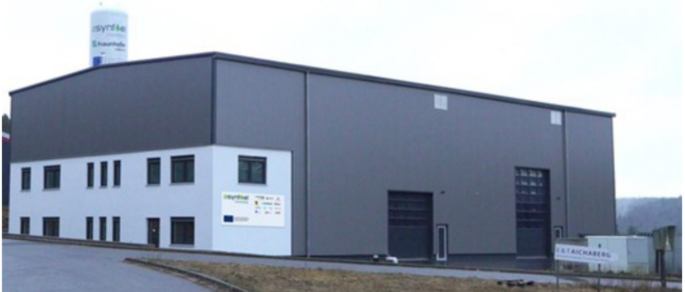
Pilot plant for the To-Syn-Fuel project in Markt Hohenburg, district of Amberg-Weiz, district of Amberg-Weiz.

The TCR® technology, developed by Fraunhofer UMSICHT, consists of a two-stage reactor system: the feed enters the first reactor stage, the Auger reactor, with intermediate pyrolysis taking place at a temperature around 400°C, and it converts the feed to char and vapor. The char and the vapor then go to the second stage reactor, which is the post-reformer, and it is designed in a way that vapor flows through the char. As the char itself acts as a catalyst, no other catalyst is needed to be added in the catalytic reforming process, which takes place then. The char is extracted and sent to the storage system, while the syngas takes its way to the product treatment, which means that oil and water are condensed from the vapor and the gas is cleaned from dust: in this way, a dust-free and high-calorific value syngas, bio-oil and carbonisate are obtained.